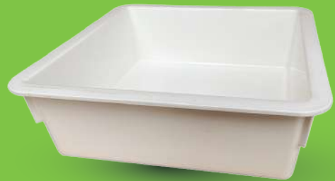
M99-3-BLK/WHT 246MM*246MM*78MM 24 TRAYS PER CARTON