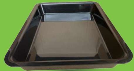
M1612-2-BLK/WHT/RED/PNK 412MM*316MM*56MM 24 TRAYS PER CARTON