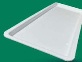
M3012-1-BLK/WHT 768MM*318MM*28MM 12 TRAYS PER CARTON