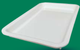
M128-1-BLK/WHT 312MM*206MM*26MM 24 TRAYS PER CARTON