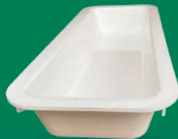
M166-2BLK/WHT 418MM*160MM*58MM 24 TRAYS PER CARTON