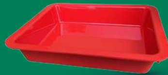
M1210-2-BLK/WHT/RED 314MM*256MM*58MM 24 TRAYS PER CARTON