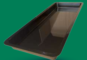
M3012-2-BLK/WHT 768MM*318MM*58MM 12 TRAYS PER CARTON

Every MTA Product has the MTA Logo on the back & are 100% food Grade. MTA Products are made & stocked in Australia