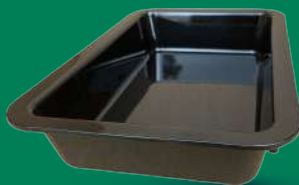
M128-2-BLK/WHT 314MM*210MM*60MM 24 TRAYS PER CARTON