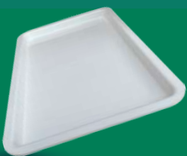
M1711-1A-BLK/WHT 430MM*280MM*26MM 24 TRAYS PER CARTON