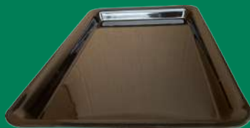
M1711-1B-BLK/WHT 420MM*272MM*30MM 24 TRAYS PER CARTON