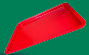
M1612-1-BLK/WHT/RED/PNK 408MM*312MM*26MM 24 TRAYS PER CARTON

Every MTA Product has the MTA Logo on the back & are 100% food Grade. MTA Products are made & stocked in Australia