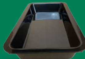
M168-2-BLK/WHT 412MM*212MM*60MM 24 TRAYS PER CARTON