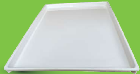
M1511-5/8-BLK/WHT 394MM*292MM*22MM 24 TRAYS PER CARTON